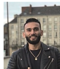
Denis of Honduras (2018)

With built-in flexibility, you'll have the freedom to choose one, two or three weeks of courses - for a tailored programme that fits your interests and schedule.