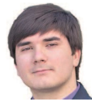
Calin of the United States (2018)

"It was amazing. I learned a lot about the European governing system."